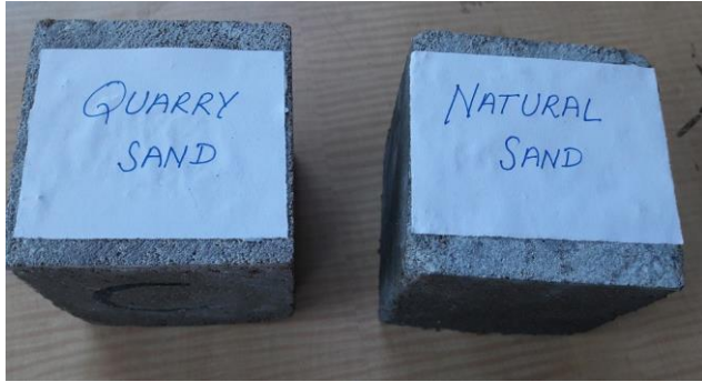
Fig -1: Sample of material