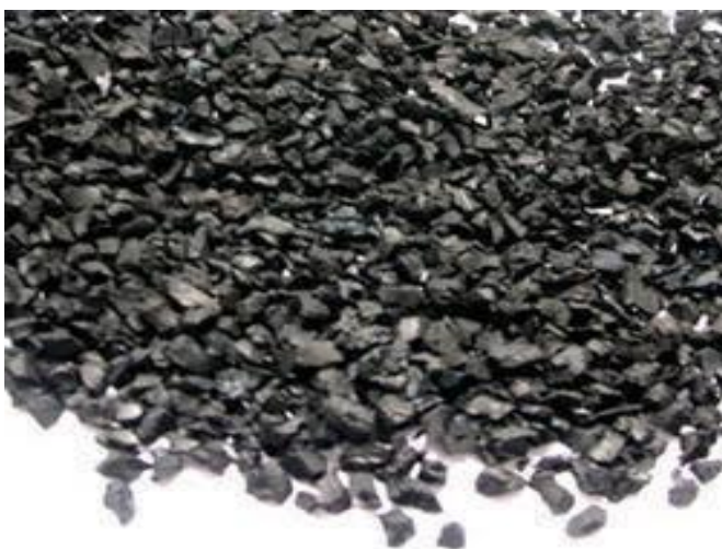
Fig. 2.1.2 Crumbled Rubber

Elastic property to the sleeper is provided by crumb rubber and it will also reduce cracks problem in sleepers. Maintenance cost reduces due to reduction in cracks and also increases lifespan of sleeper.