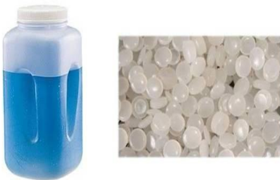
Fig. 2.1.1 HDPE

As a chief component with fiber as reinforcement or fillers to enrich properties polymer composite sleeper assimilate a polymer material recycled HDPE. Hence, toxic preservatives will not be required by sleepers. No water absorption problem which cause loss of strength.