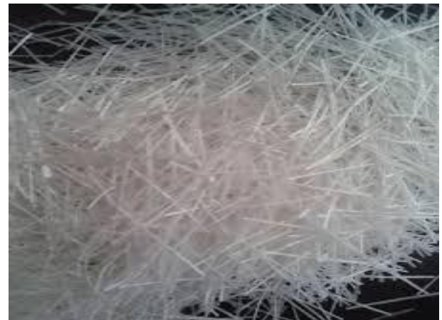
Fig. 2.1.3 Glass Reinforcement

For sleepers fibers act as reinforcement. Fiber is both strong and stiff in tension and compression.