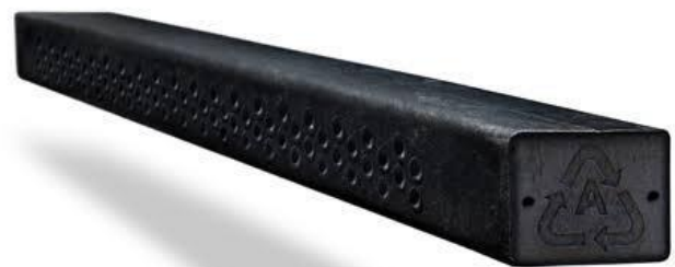
Fig. 2 Composite sleeper

The proprietary mixture of plastics is composed for composite sleeper (mainly shredded HDPE), rubber from whole post-consumer tyers, rubber buffing from retreaders, other waste materials, chemical additives and various fillers and reinforcement agents like fiberglass or vermiculite. Approximately 20% of overall mixture content in rubber. Following is 5 stages of manufacturing process that establishes efficiency and consistency in production: