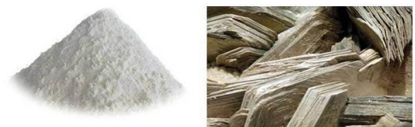
Fig. 2.1.4 Fillers

By combining above materials (on the basis of properties) a superior quality of material can be achieved for railway sleepers.