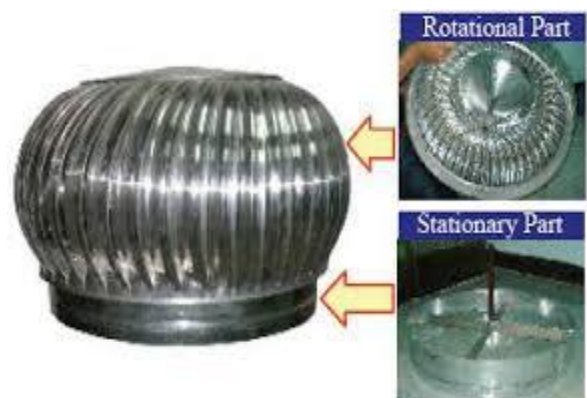
Fig 2.1 construction of wind ventilator

In this paper is interested to the second type that comprise of stationary part and rotational part. Stationary part is composed of base and fixed shaft and rotational part is composed of fan blades and bush that put on the fixed shaft on stationary part. In this system the principle of wind ventilator, when the air flow on the top of wind or the heat air that lifting to under the wind , it turns the wind ventilator. Ventilation rate is up to the speed and the size of wind ventilator. Figure 2.1 shows the construction of wind ventilator.