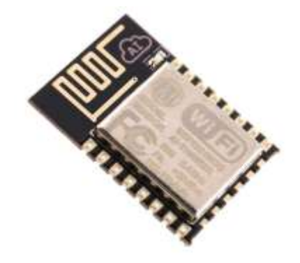
Fig -2: ESP8266

This is a microcontroller which takes in the Analog signal from the sensor as RAW data and converts it to readable data. After this it sends this data over WiFi network through MQTT.