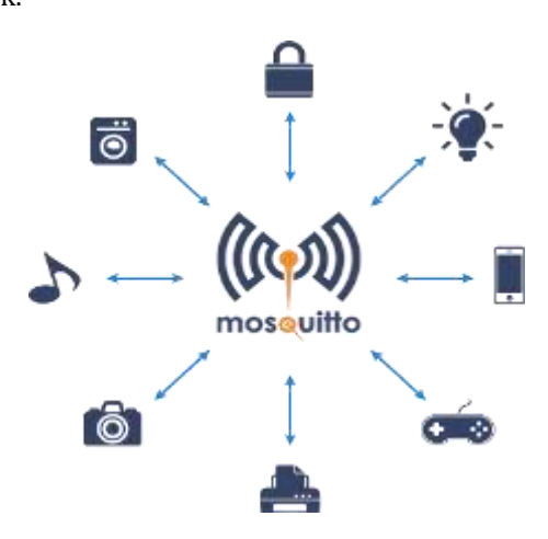
Fig -4: Mosquito MQTT

The MQTT protocol provides a lightweight method of carrying out messaging using a publish/subscribe model. This makes it suitable for Internet of Things messaging such as with low power sensors or mobile devices such as phones, embedded computers or microcontrollers. This is used to send messages from the sensor to the home server over WiFi network.