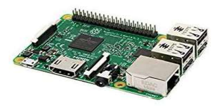
Fig -3: Raspberry Pi

A Raspberry Pi is a single board computing device or simply saying a small credit card sized single board computer that runs on a 5V external power supply. This was founded in UK for providing low cost computing solution for education but as time passed the Raspberry Pi grew stronger, faster and due to increasing community support we can find lots of compatible software. Hence at present Raspberry pi is capable enough to perform most of your task that your normal PC or mac can do with additional advantages. It can be used for IOT projects implementation as it only runs on 5V power supply and consumes only 9W of power therefore it has infinite possibilities to expand itself in many fields. In our project this will act as the home server on which we will install MQTT server and Home Assistant.