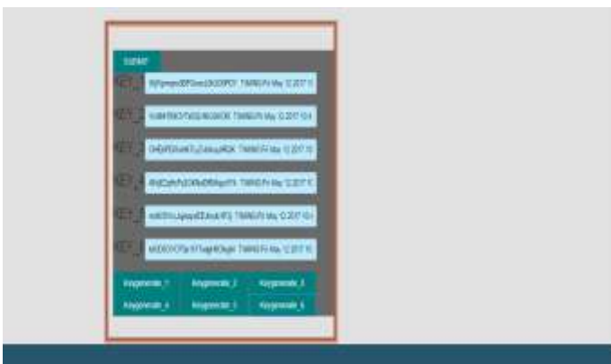
Fig5: Polynomial Key Generation

The private key is been sent to the owner, it changes each and every time when the owner login.