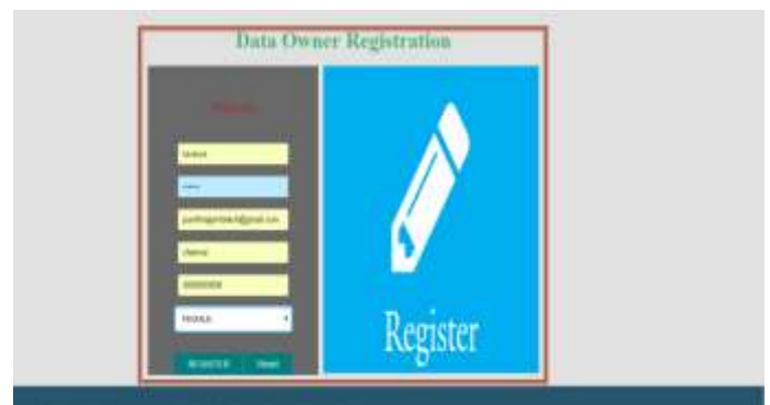
Fig2:Data owner registration

The above figure shows that first the data owner has to register to get the access to the data.