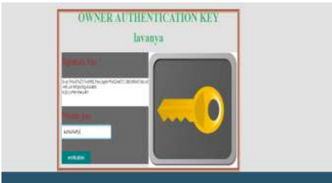
Fig3: Data owner authentication

The data owner is been authenticated for security reasons with the signature key and private key.