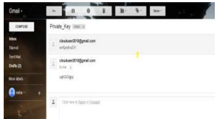
Fig7: Owner Private Key

It represents the file details which are been uploaded, we can view and download the file.