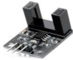
Speed Measuring Sensor [4]

3. Micro SD Card Storage- For this system we have used KG072 micro SD card Storage Device which is directly connected to Arduino chip which controls all the functions of other sensors. This storage system is stores all the digital data which is get collected from all the sensors.