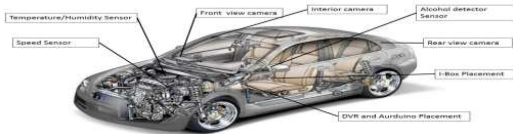
Basic layout of car BLACK-BOX implementation [12]