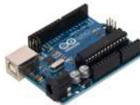
Arduino Uno Board [6]

4. Arduino Uno R3 Board- Arduino Uno is a microcontroller board which is based on ATmega 328. It consists of 14 digital I/O pins, 6 analog pins, a power jack, a reset button, a 16b MHZ crystal oscillator and an ICSP header.* Arduino boards designs uses a variety of microprocessors and controllers. This board act like a brain for the all sensors it collects all the data from sensors and send it to the micro SD card storage module.