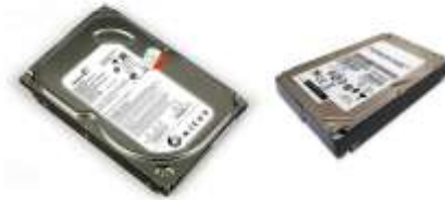
Hard Drives [10]

5. Hard Disk Drive- In this system we have used 1TB hard disk to store specifically all the video and audio data.