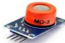
Alcohol Detector Sensor [7]

1. Alcohol Detector Sensor- MQ3 Alcohol detector sensor senses the level of alcohol in the different levels like: Sober, Drunk, heavily drunk. This sensor is mainly used in breathalyzer. This sensor have low sensitivity to benzene and high sensitivity to alcohol. When the alcohol level increases above the set limit the buzzer present in circuit starts to warn by making a beep sound.