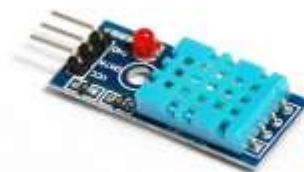
Temperature and Humidity Sensor [3]

1. Temperature and Humidity Sensor - In this system we used DHT11 Temperature and humidity sensor to record the temperature and humidity. This sensor is fitted near the engine so that at the time of accident it can record temperature and humidity of the vehicle engine compartment. By using this sensor we could know the accident cause in case of engine catching fire or other causes.