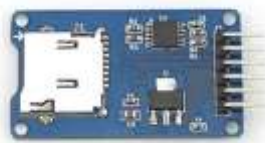
Micro SD Card Storage [5]

3. Micro SD Card Storage- For this system we have used KG072 micro SD card Storage Device which is directly connected to Arduino chip which controls all the functions of other sensors. This storage system is stores all the digital data which is get collected from all the sensors.