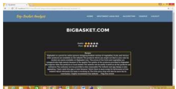
Fig 3. Review by the User