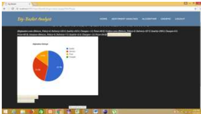
Fig 4. Big Basket Rating

Reviews are analyzed and studied with the help of sentiment analysis and rating is given according to the services. Figure 2 gives the rating given by the user.