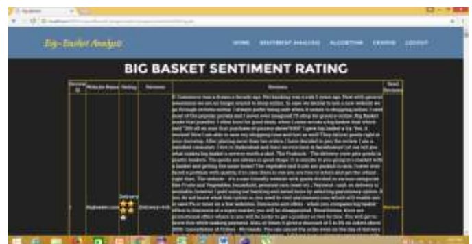
Fig 2. Big Basket Sentiment Rating

The customer's reviews are fetched by using a web scrapper. A web scrapper is an API used to extract meaningful data from a website. The reviews are collected from a social networking site, mouthshut.com.