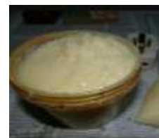
Figure 2: GEL