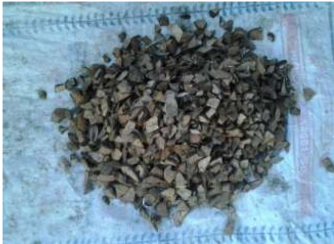
Figure 2: Coconut shell as aggregates

Coconut shell particles are used as reinforcing material for investigation. Shell particles of size between 20 mm – 600 \mu are set up in pounding machine. Coconut shell totals are potential possibility for the advancement of new composites due to their high quality and modulus properties. An estimated estimation of coconut shell density is 1.60 g/cm 3 .