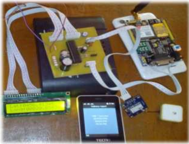
Fig-3: Image of the complete system assembly with LCD showing the position of the vehicle

Fig. 3 shows the assembling of the different modules of the proposed vehicle tracking system and Fig 4 shows the completely cased system. In testing, we fixed the completed vehicle tracking device in a car as shown in Fig. 4 and allow the car to be driven away to a different location. We then send an SMS with a registered mobile phone to the GSM modem with a registered SIM card with a command "TRACK VEHICLE" and an SMS was received by the mobile phone. The SMS gave the latitude, longitude and time as shown in Fig. 5.