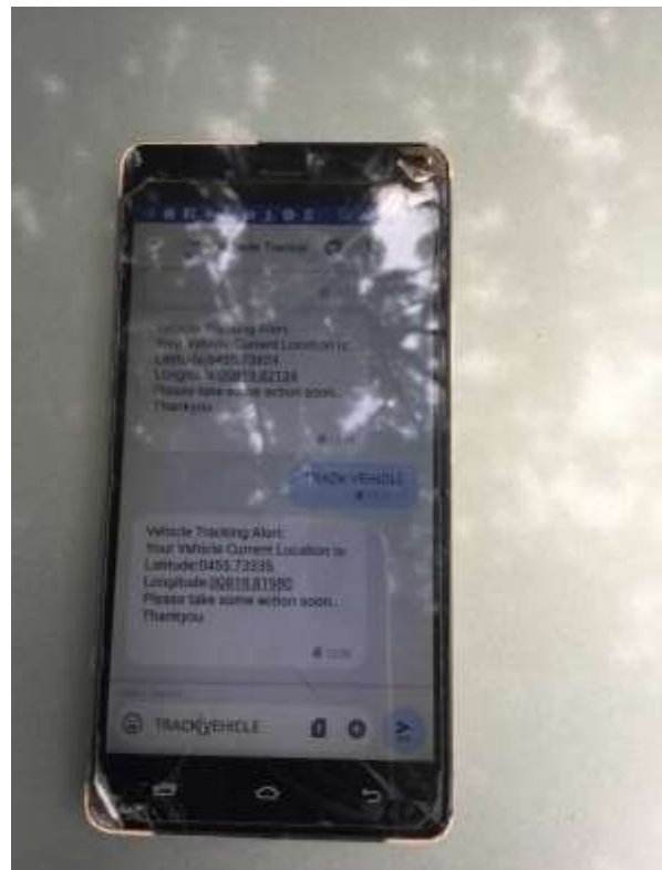
Fig-5: Owner's mobile phone Screenshot of returned SMS to a TRACK VEHICLE request

This system shows the location of vehicle on the LCD connected to it to ensure the working condition of the microcontroller.