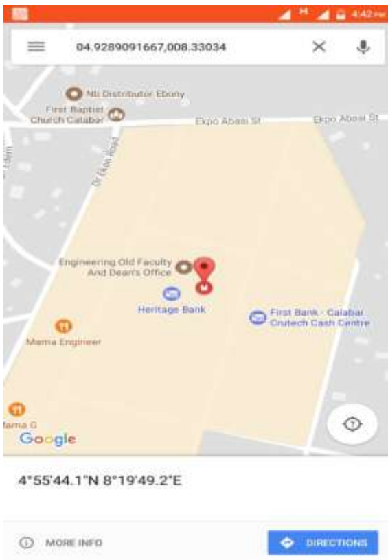
Fig-6: Google map location of the vehicle and tracking system