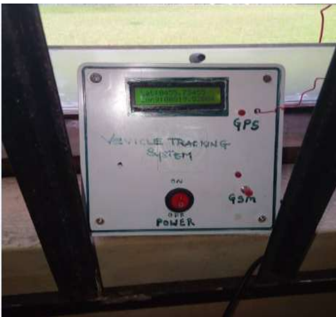
Fig - 4: Image of the complete system assembly with LCD showing the location of the vehicle