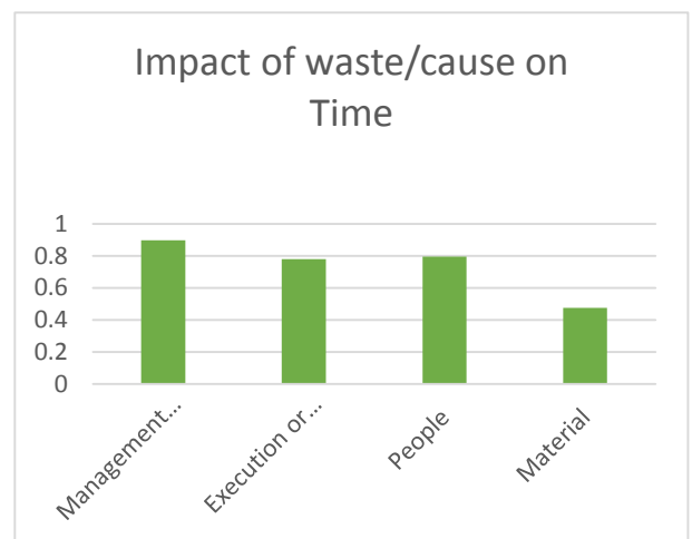
Fig 5.4: RII of impact of waste on cost