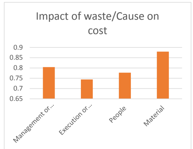
Fig 5.2: RII of impact of waste on cost

The impact of material and management related waste is comparatively higher than the impact of people and execution on cost is as shown in fig 5.2 Whereas, material, people practices and execution related waste affects the quality more as shown in fig. 5.3 and, Project time affects more by management related waste and people related waste as shown in fig. 5.4