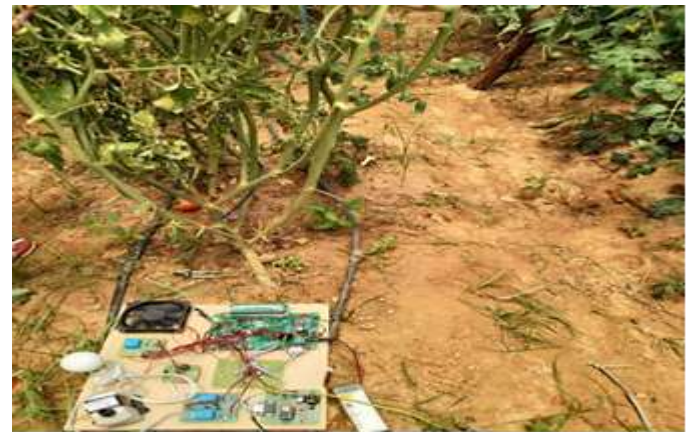
Fig 6: Installation of the developed system at GKVK

Fig 6 shows installation of the developed system close to the tomato plants grown inside conservatorium. The optimum temperature and moisture conditions are monitored and controlled using the designed prototype. Fig 6 shows use of system developed.