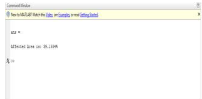
Fig 3: Percentage of disease in the selected image (=39%)

available on board. Time division multiplexing technique can be used to handle multiple signals. Based on ADC data, microcontroller takes decision for switching ON or OFF of the respective relay. An inverting current booster ULN2803 is used to supply sufficient drive for the relay operation.