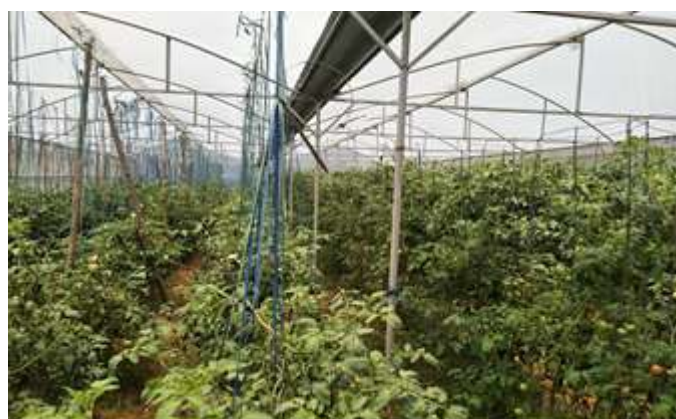
Fig 5: Tomato plants in conservatorium

Fig 6 shows installation of the developed system close to the tomato plants grown inside conservatorium. The optimum temperature and moisture conditions are monitored and controlled using the designed prototype. Fig 6 shows use of system developed.