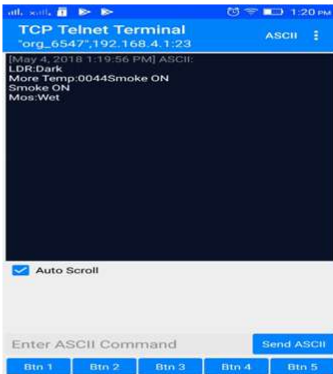
Fig 8: TCP Telnet Terminal Results