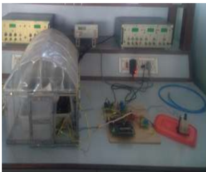
Fig 9: Prototype developed for testing in the lab environment.

Some of the researchers have used IoT (Internet of Things), wireless networks for continuous transfer of sensor data to a distant node [3-10]. But, this adds overheads in terms of power consumption and bandwidth consumption. Present work minimizes power consumption using automated wired control of devices and saves bandwidth by transferring the data only when the specified range is crossed.