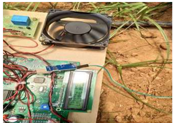
Fig 7: Functioning of the developed system

Description of the status of devices shown in Fig 7: Fan is on indicating temperature more than 40°C; motor which pumps water to the farm turns on indicating dry soil (motor is covered in Fig 7). As there is no detrimental gases detected and smoke sensor is in off condition. As there is sufficient light available already the bulb is not on.