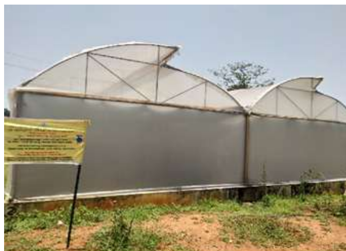
Fig 4: Conservatorium in GKVK

Developed system is tested at the University of Agricultural Sciences, Gandhi Krishi Vignan Kendra (GKVK), Department of Horticulture, Bangalore, Karnataka. The test set up was installed in a conservatorium with tomato plants. Fig 4 shows a glimpse of the Conservatorium at GKVK and Fig 5 shows cultivation of Tomato plants inside the conservatorium. Fig 9 shows a prototype model developed in the present work used in the lab environment mimicking the GKVK conservatorium and small plants being grown inside it.