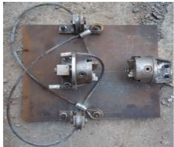
Fig No. 1: Attachment