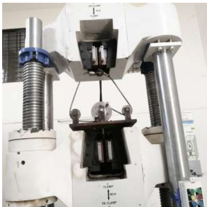
Fig No. 2: Attachment Mounted On UTM