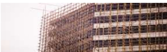
Fig 6: Scaffolding

Bamboo poles lashed together have been used as scaffolding in high rise structures due to their strength and resilience. The timber planks can be replaced with bamboo culms and these can be lashed to the vertical culms.