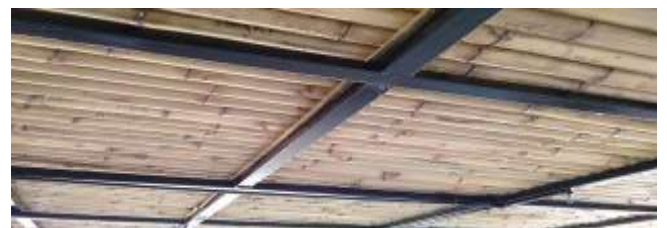
Fig 3: Bamboo roofing

It consists of bamboo truss or rafters over which solid bamboo purlins are laid and lashed to the rafter by means of G.I. wire. A mesh of halved bamboo is made and is lashed to the purlins to cover the roof.