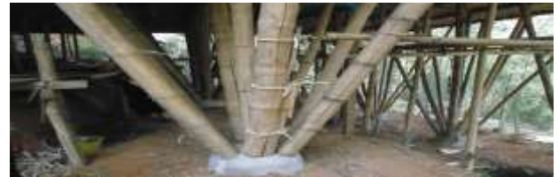
Fig 7: Bamboo Foundations

For use as foundation, the bamboo poles are directly driven into the however, be pre-treated for protection from rot and fungi. This prolongs the life of the foundation beyond that of an untreated bamboo pole.