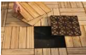
Fig 5: Bamboo flooring

Bamboo can be used material due to its better wear and tear resistance resilience properties. Whole culms act and the floor covering is done using bamboo boards, mats etc by means of wire to the frame.