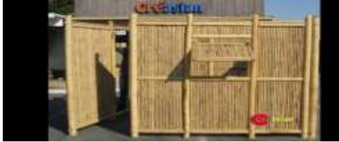
Fig 4: Bamboo wall

Cement or lime plastering can be done on the mud covering for better appearance and hygiene. It has been found that the bamboo in the vertical position is more durable than in horizontal direction. For partition walls only single layer of bamboo strips are used.