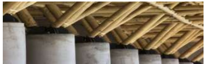
Fig 2: Bamboo truss

The bamboo has strength comparable to that of Teak and Sal. A frame is made using bamboo rafters, purlins etc for fixing the roof.