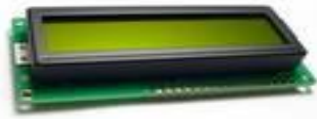
Fig.4.2. LCD Display