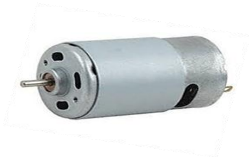
Fig.4.3. DC Motor

A DC motor is any of a class of rotary electrical machines that converts direct current electrical energy into mechanical energy. The most common types rely on the forces produced by magnetic fields. Nearly all types of DC motors have some internal mechanism, either electromechanical or electronic; to periodically change the direction of current flow in part of the motor.