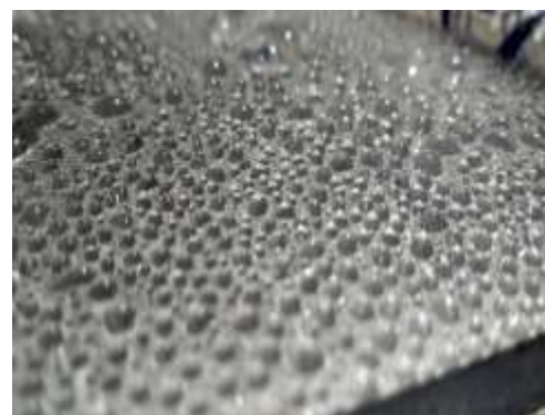
Fig -1: Dew condensing over the surface of prototype

From the experimentation we found out that the coating of Hydrophobic-Hydrophilic substance on the substrate was successful in extracting dew from the atmosphere. We conducted the experiment for two days in night conditions. The experimental setup was highly influenced by weather