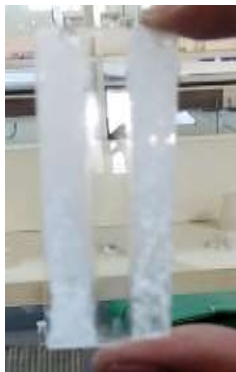
Fig -2: Nanocomposite coated Sample