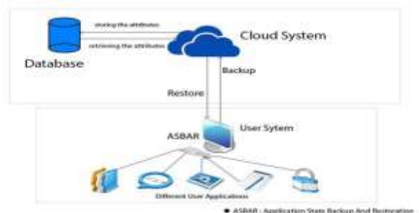
Fig -1: ASBAR System Architecture

The user system has different application installed and is using different web services. While using these applications the system constantly keeps backing up data and accordingly the cloud system stores the data attributes in the database. So, if the application fails because of certain reasons the data stored in cloud system is used to restore the state of the system when the user requests for state restoration.