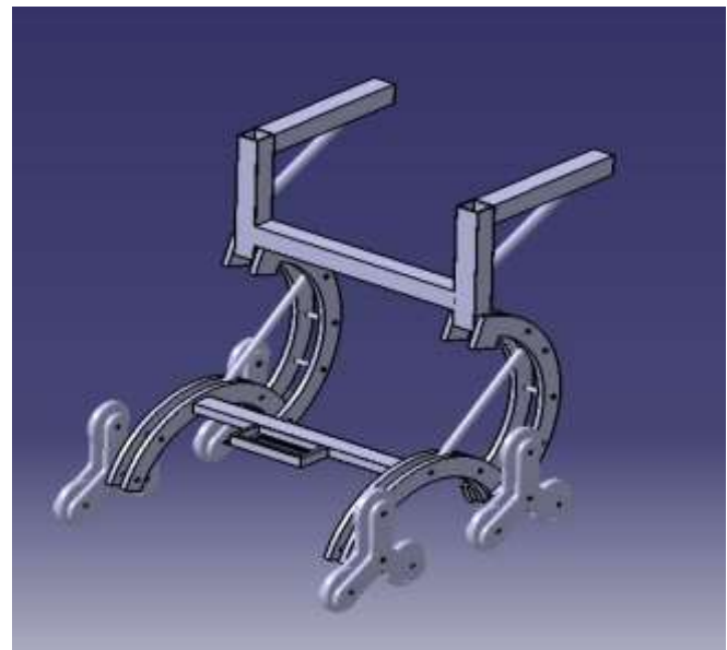
Figure 3.3 cad design of mobility assist

This project consists of frame, dc motor, battery, screw rod, pneumatic cylinder, wheel and bearing. The frame is mounted with the step climbing wheel. The pneumatic cylinder is mainly used for the purpose of lifting the climber while moving up and down the steps. The screw rod is mounted with the Dc motor and the Dc motor get the power from the battery. When the Dc motor is ON, the screw rod gets rotated forward and backward direction for lifting the person easily. The screw rod moves forward and backward when there is a variation in the height of the steps.