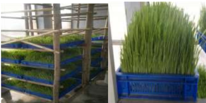
Fig -1: Bamboo Structure and Tray

Our goal was to make this fodder completely in an organic manner, and to suit the local Indian conditions for development of a cost-effective hydroponics Fodder device. Hence, we decided to use fungicide and nutrient solution commonly known as Beejamrit .