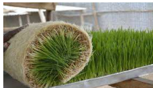
Fig -3: PVC Structure and Trays