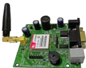
Fig -2: GSM Module

In our system, we have used automatic water sprinkling system. This constitutes temperature & humidity control, water level control. In this system, GSM module is also used to inform user or farmer, about water level in tank and readings of temperature and humidity.