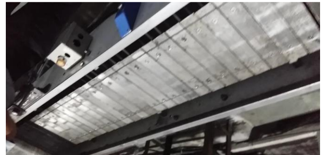
Fig.2: Magnetic conveyor belt

belt it gets lifted and get struck to the magnetic conveyor. Further the tins are transported from one section to another section