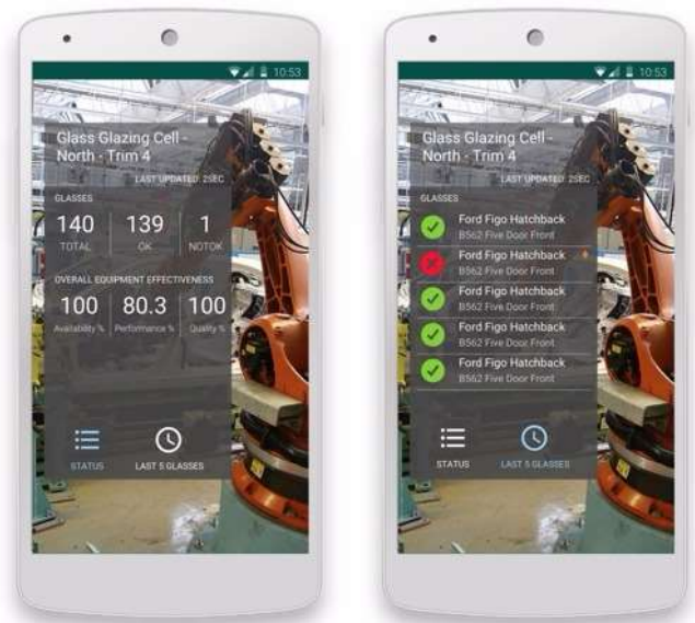
Fig -4: AR Application running on Android phone