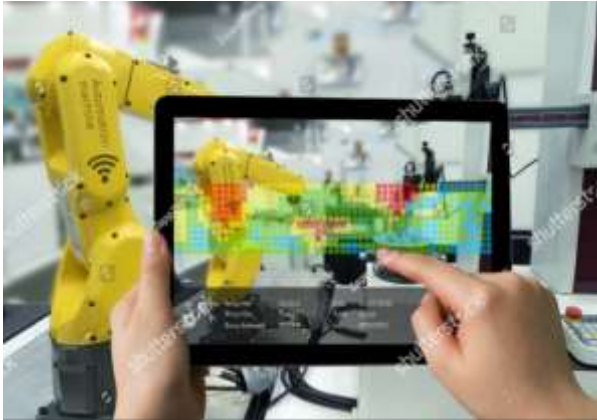
Fig – 2: Augmented Reality in Industry 4.0