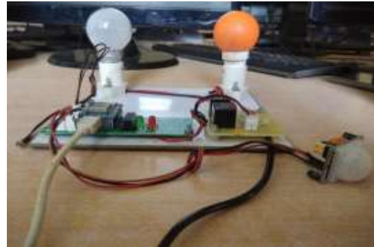
Fig -3: HARDWARE SYSTEM