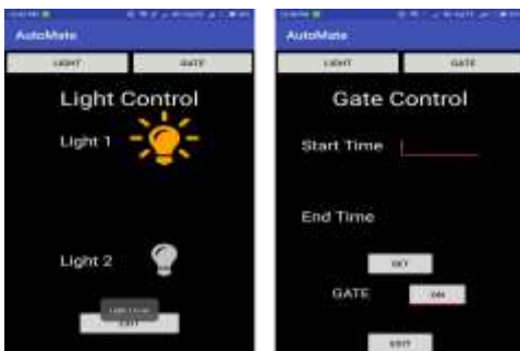
Fig -2: SCREENSHOTS OF ANDROID APPLICATION

Some screenshots of Android Application given in Fig. 2