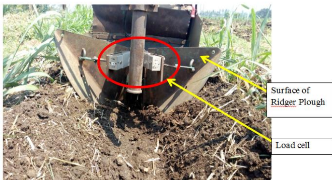
Fig 2.1. Back view of ridger plough with load cell

Arrow is shown on Load cell. This arrow shows the direction of force on the load cell. This type of arrangement is done by using metal strips. Metal strip is attached on the Load cell by using bolts. [12]