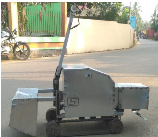
Fig - 2 : Actual Design