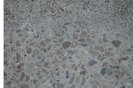
Fig.1.1 Concrete is a mixture of cement and aggregate, giving a robust, strong material that is very widely used.

Concrete is the most common artificial composite material of all and typically consists of loose stones held with a matrix of cement. Concrete is an inexpensive material, and will not compress or shatter even under quite a large compressive force. However, concrete cannot survive tensile loading (i.e., if stretched it will quickly break apart). Therefore, to give concrete the ability to resist being stretched, steel bars, which can resist high stretching forces, are often added to concrete to form reinforced concrete.