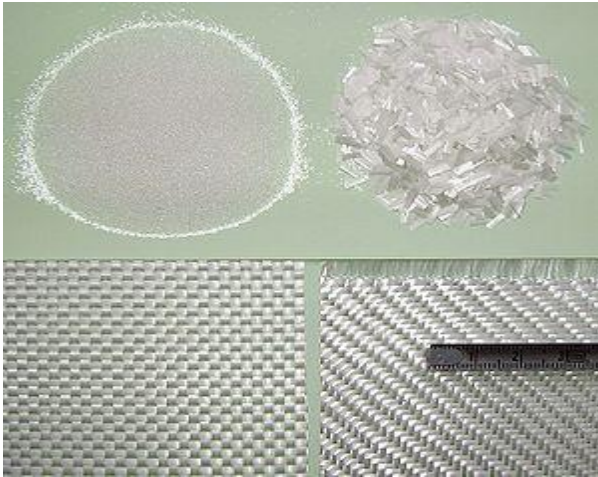
Fig. 1.5 Reinforcements Fibre

Cement, metals, ceramics, and sometimes glasses are employed. Unusual matrices such as ice a Differences in the way the fibres are laid out give different strengths and ease of manufacture. Reinforcement usually adds rigidity and greatly impedes crack propagation. Thin fibres can have very high strength, and provided they are mechanically well attached to the matrix they can greatly improve the composite's overall properties.