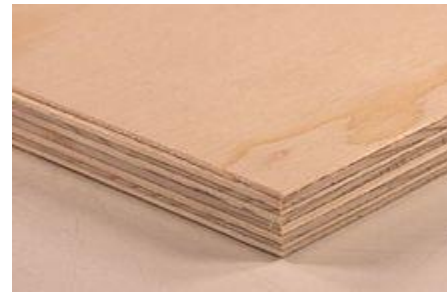
Fig.1.2 Plywood is used widely in construction