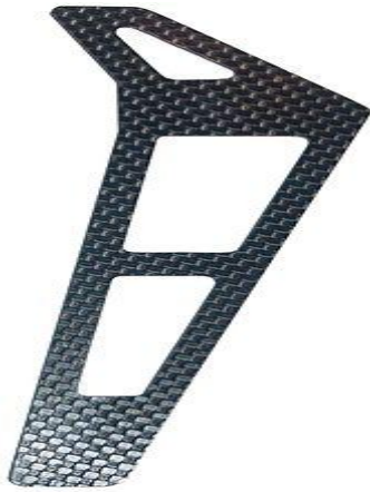
Fig. 1.3 Carbon fibre composite part.

structure to choose an optimum combination. Do not use abbreviations in the title or heads unless they are unavoidable.