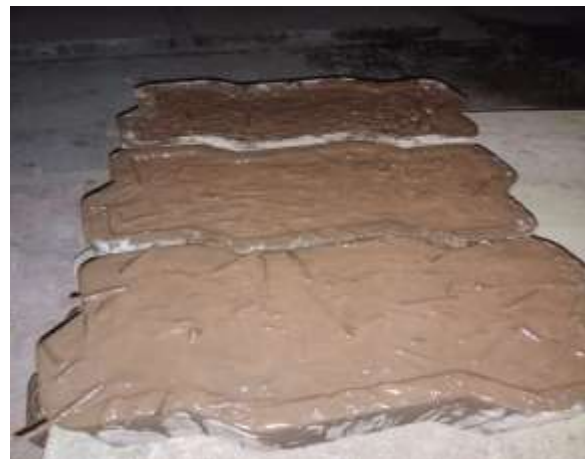
Fig -2: manufacturing of bloks.

For this project we brought the materials from the store and we casted the paver blocks by compression mould machine on the site itself with the help of their equipment's. All materials are properly mixed and pored in moulds. Moulds are compacted by table vibrator.