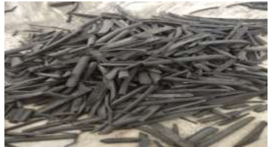
Fig -1: Tyre waste

Abstract - This project studies the use of rubber waste and recycled paver block material in production of concrete paver block. aims to study possibility of using rubber waste, recycled paver block material in making of paver block. in this project investigation to analyse the compressive strength of paver block To compare the strength of paver block with various wastages to the conventional concrete paver block. Aggregate which passes through 20 mm is sieve and retain on 4.75 mm is sieve is used for making of paver block. This paver block is for footpath or parking areas. and those paver block are demolish are use as a recycled paver block material.