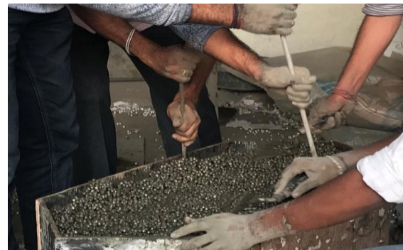
Fig -4: Showing Placing and Compaction of Concrete

Before the placing the concrete mould was cleaned and oiled to prevent the formation of bond between concrete and mould. The fresh concrete filled into the mould of boat in three layer uniformly with hand compaction, sufficient blows were given after adding each successive layer. In case of concrete with EPS Beads Vibration makes segregation that's why more preference is given to hand compaction method. After the compaction has been completed, the excess concrete was removed from the mould with the help of trowel and the surface was leveled.