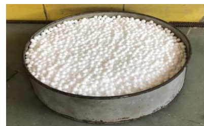
Fig -2: EPS Beads