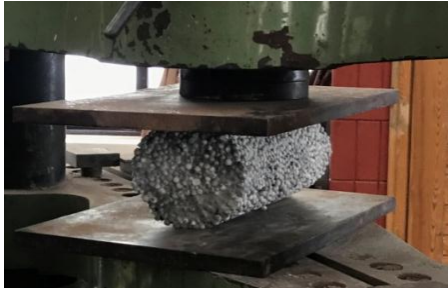
Fig -9: Split Tensile Strength Test