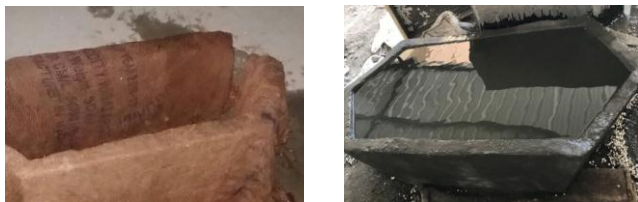
Fig -6: Curing