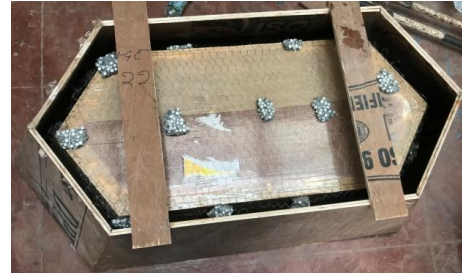
Fig -3: Reinforcement Placing