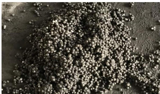
Fig -1: Floating Concrete

This Project investigates the properties of the Floating concrete by using a EPS Beads. In this technique the EPS Beads are used for preparation of the Floating concrete and density is reduced to attain the maximum efficiency, whereas the self weight of the structure is minimized thereby reducing the dead load on structure. Expanded Polystyrene (EPS) is one of the most widely used plastics, the scale being several billion kilograms per year. The polystyrene foam is a thermoplastic material obtained by polymerization of styrene. The use of expanded polystyrene in construction has lot of advantages compare with the use of conventional materials which results in sustainable future. The use of EPS Beads also reduces the environmental hazards that causes during its disposal. Most of this kind of waste is late unnoticed and they will lead to global warming.