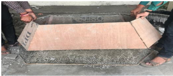
Fig -5: Demoulding