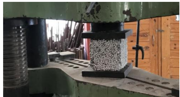
Fig -8: Compressive Strength Test