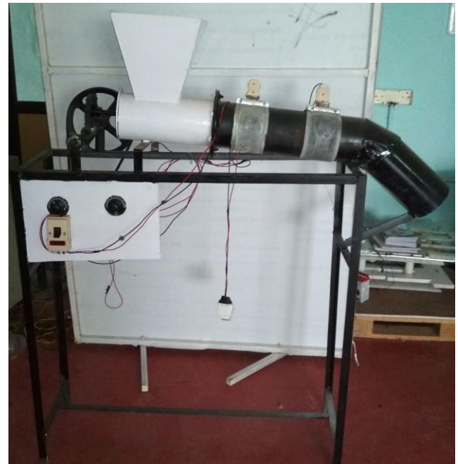
Fig -3: Activated carbon manufacturing machine