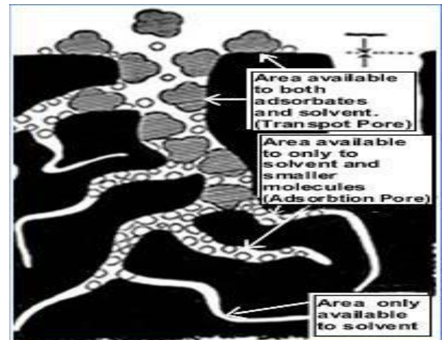
Fig -1: Adsorption mechanism

Activated Carbons are the most powerful adsorbents known. It is basically a solid material consisting mainly of pure carbon. A characteristic feature is its porous structure and the resulting immense surface area which may be as large as 1500 m 2 /gm. Due to its exceptional adsorption qualities, activated carbon is widely used in process destined to purify, discolour, recuperate and remove odours at low cost and superior efficiency