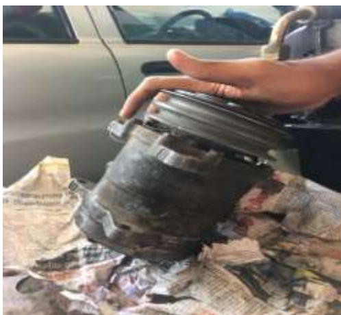
Fig 3.2 Compressor

The compressor used is piston type compressor. The following are the details of the compressor: