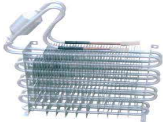
Fig 3.3 Evaporator

The evaporator is the part of a Maruti 800 AC car with dimensions 7.5*7.5*2.5mm 3 . The bare tube evaporators are made up of copper tubing or steel pipes. The copper tubing is used for small evaporators where the refrigerant other than ammonia is used, while the steel pipes are used with the large evaporators where ammonia is used as the refrigerant.