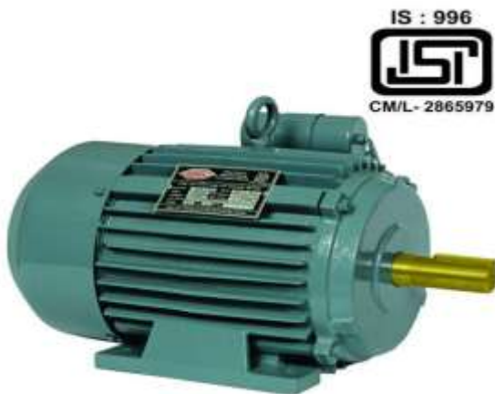
Fig 3.1 motor

The compressor of the AC unit is run by a single phase DC motor instead of powering it with an engine. After charging the AC unit the 2 other motor unit with .5 and 1.5 HP was tried. The motors couldn't run the compressor and the AC unit. Later a 2HP single phase DC motor was used to run the AC unit. In an actual case the compressor is run at various engine speeds. The tonnage of the AC unit depends on the speed and it is nearly on an average of 0.75 TONNE. A 2HP motor is sufficient to run that compressor.