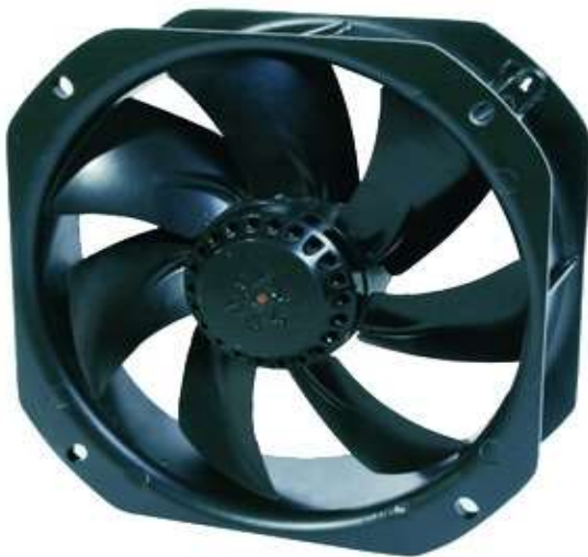
Fig 3.6 Blower

Air conditioner blower or fan Fig 3.9 is one of the key components that is needed as part of the air conditioning system. The function of the blower is to produce air movement to the space that is being conditioned. A DC supply powered blower is used for cooling the condenser coils. This blower is powered by a 12 volts battery. It is attached to the condenser coils. The specifications are: 12V and 30cm diameter. There are basically four types of fan that are commonly used in the HVAC equipment. They are the propeller fan, centrifugal fan, vane-axial fan and tube-axial fan