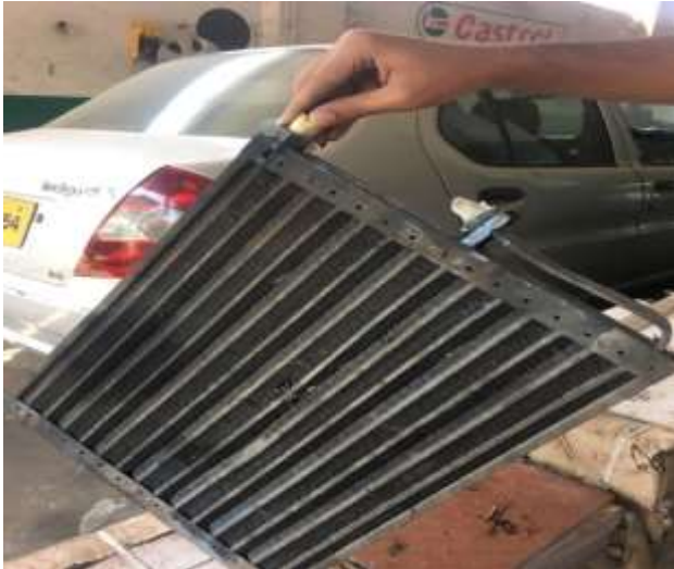
Fig 3.5 condenser coils