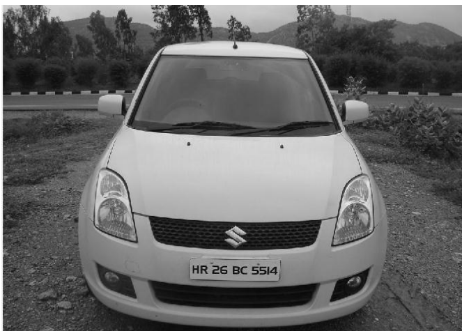
Figure 3:-RGB to Gray Format

This is second phase in the system. We will work on the image taken as the input from above step. It is in RGB format. We will be converting that image into gray scale using MATLAB.