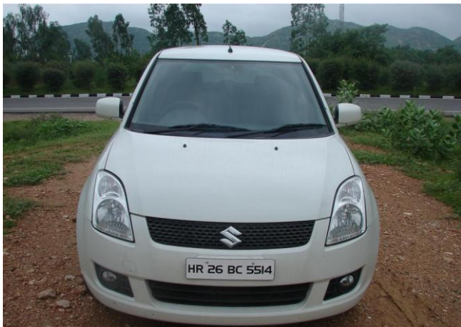
Figure 2:-Car Image