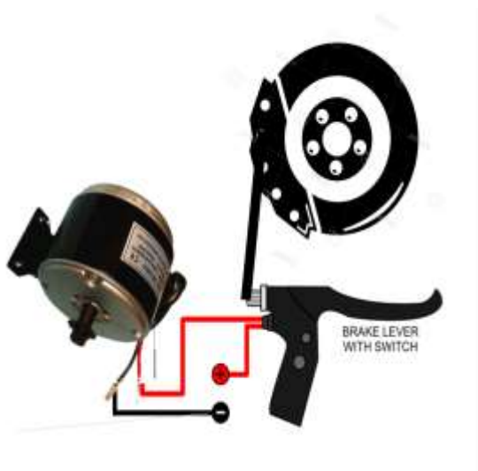
Fig -4: Setup of Break

There is special type brake required, for safety from burning it due to making hotspot in winding of motor. Need of stopping electric current flowing through motor when applying mechanical brake, for it we use small on-off press switch near hand brake lever that cut the electric circuit when press it.