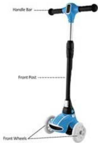
Fig -3: CAD Drawing of Steering System