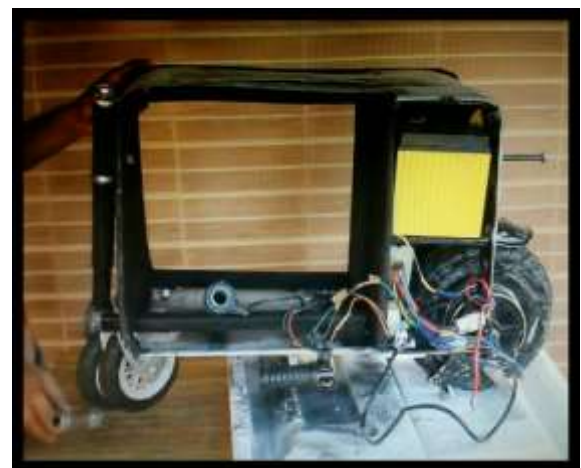
Fig -5: Final Setup

The Solar portable bike is unique rid able luggage. Do not jump off a moving vehicle. Always come to a stop before getting off. If exceed the ability of the product, such as riding over obstacles, uneven terrain, slippery surfaces, loose materials, or steep slopes, you will lose control, leading to collisions, falls, and injury. Avoid sharp ups and deeps surfaces, more watered i.e. in rainy Saigon because of it is not 100percent waterproof, also avoid steep slopes, and obstacles. If you cannot avoid a slippery surface, loose material, steep slope, or obstacle, then you must carry or tow your solar portable bike to move across it. When riding, keep both hands on the handlebars and both feet on the foot pegs. Be relaxed.