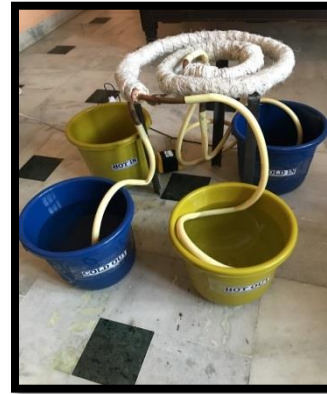
Fig 5 Final Experimental Model