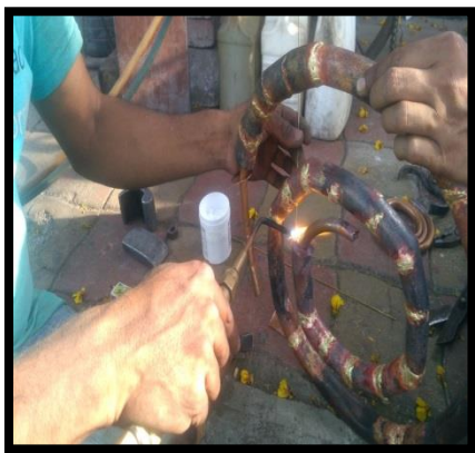
Fig 4 Fabrication of Set up