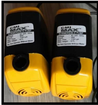
Fig 3 Submersible Pump