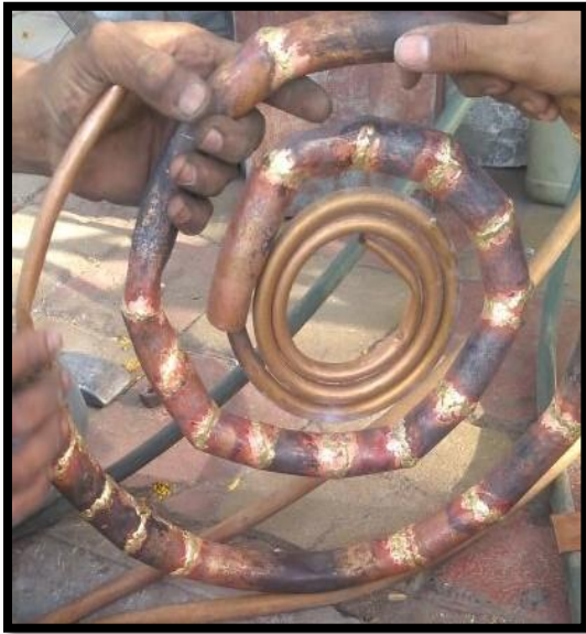
Fig 2 Spiral Tube in Tube