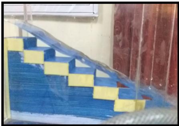
Figure 1 – Model A