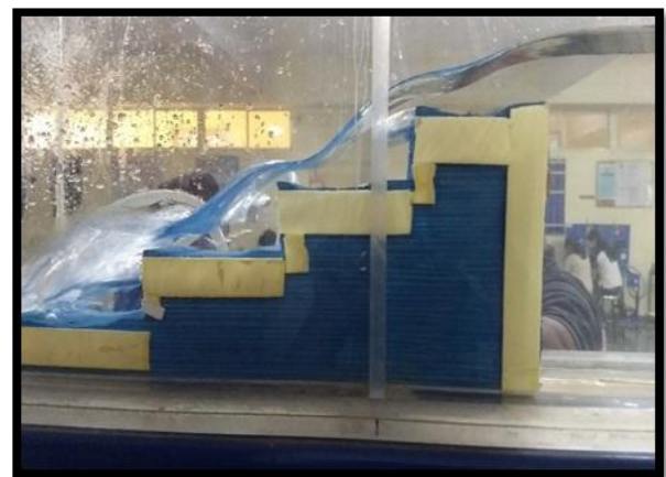
Figure 3 – Model C