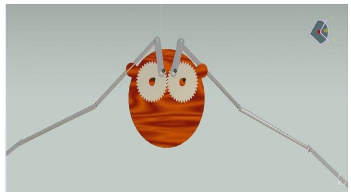
Fig 3.4.1 Catia model of the wing

The mechanism includes a slider crank mechanism and two bell crank mechanisms on each wings. Altogether the wing have a total of three degrees of freedom.