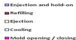
Fig. 4.1 Cycle Time Analysis

From above analysis, it is clear that ejection time is more important factor in all over cycle time of component. Then started new concept for modification in ejection system. Existing ejection system consists of one center ejector and two side ejectors. Mainly component catching problem found in front side of the mould. Many discussions between mould manufacturing team, design team and production