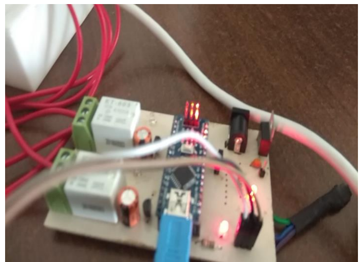
Fig -3: Hardware