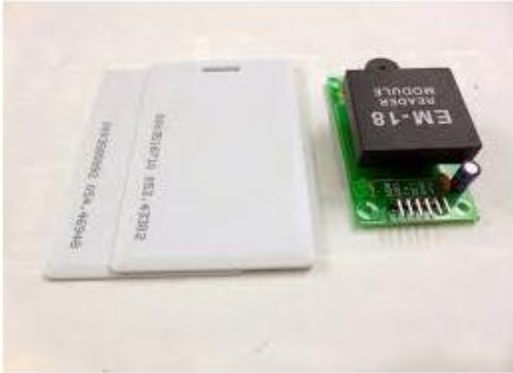
Fig -2: RFID card and card reader

cut off, thereby opens the circuit. So the supply is cut off. In order to recharge the information is passed on to the utility section. Using the recharge mode in the software the card is again recharged for the required amount. The time interval between two successive readings are taken as a month. The maximum limit for a month is fixed to be Rs.50. If there is a balance amount at the end of a month then this amount will be credited to the next month with pulses being set again to zero. The buzzer is provided when the recharge amount is about to be over. The figure 2 shows the RFID card and card reader.