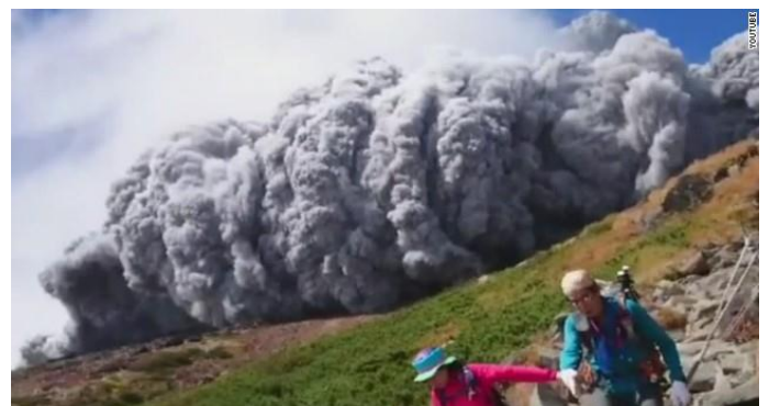
Fig -2: Volcanic ash envelopes hikers [5].

Among them, the most common technique is analyzing the seismic data by installing the seismic sensors [6]. However, the seismic data is not enough to be considered as there are many other geological factors needed to be investigated. There are other monitoring methods including the study of deformation and monitoring the gases that come from fumaroles. Monitoring the change of temperature of the gas seems comparatively easy and the abnormal increase of temperature might be a mark for the volcanic eruption.