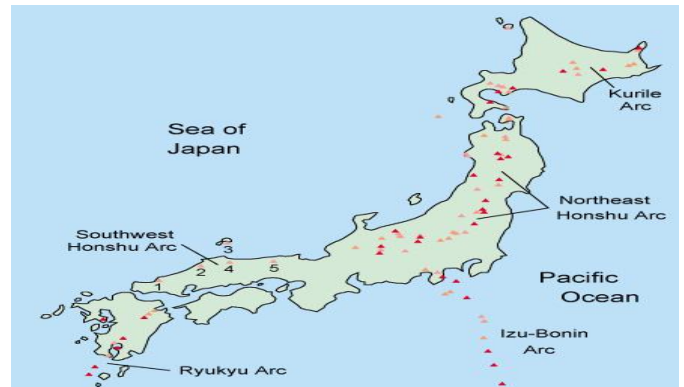
Fig -1: Distribution of volcanoes and volcanic arcs in Japan [4].

For decreasing the risks of death and damages, noteworthy developments are needed to make an accurate prediction of volcanic eruption in advance. There are several techniques for monitoring the volcanic eruption.