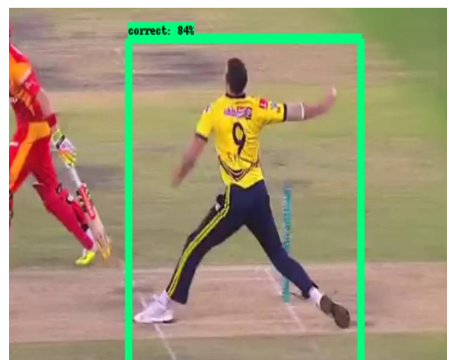
Figure 4. – Result showing identification of fail ball