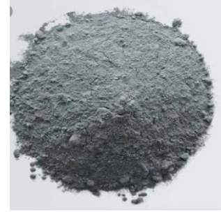
Fig: 4.1.2 class F fly ash

It is the waste obtained as a residue from burning of coal in furnaces and locomotives. In present study class F fly ash is used, it is the burning bituminous coal, it consists of alumina and silica and has higher loss of ignition than class C fly ash and also it has lower calcium content than class C fly ash.