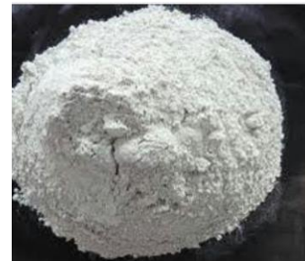
Fig: 4.1.3 GGBS

Ground Granulated Blast-furnace slag is a by-product of iron and steel making from a blast-furnace in water or steam, to produce a granular, glassy product then that is dried and ground into fine powder.