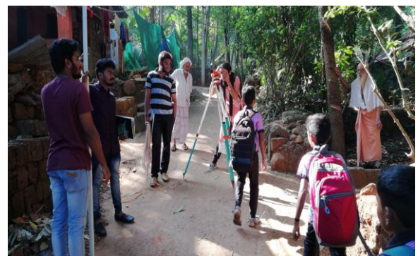
Fig.2 Engineering survey

Through the engineering survey the water quality test and method of treatment is determind and through leveling survey , map and node prepared on basis of engineering survey.