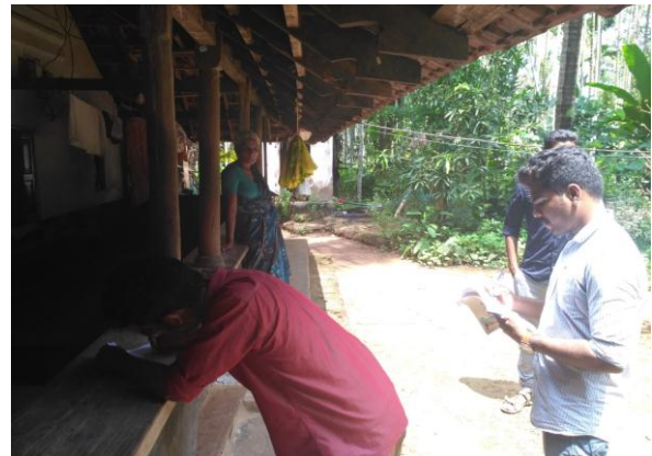
Fig.1 Community survey

through the cummunity survey the data collected from households and also feasibility and preliminary survey carried out.