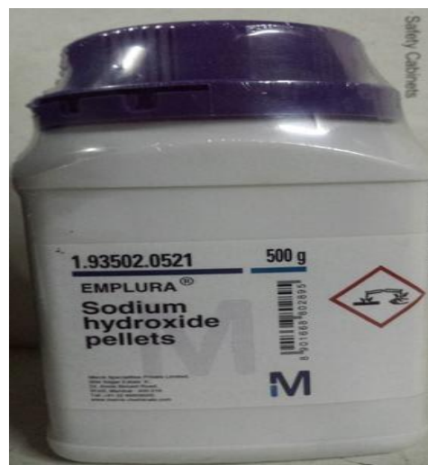
Fig.2 Sodium Hydroxide Pellets

NaOH is also commonly used as an alkaline activator in geopolymer production. Generally NaOH is available in market in the form of pellets or flakes form with 96% to 98% purity where the cost of the product depends on the purity of the material. The solution of NaOH was formed by dissolving it in water with different molarity. It is recommended that the NaOH solution should be made 24 hours before casting and should be used with 36 hours of mixing the pellets with water as after that it is converted to semi-solid state.