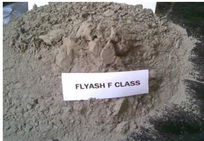
Fig.1 Class F Fly Ash