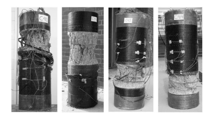
Fig -1 :Rupture aspect of RC columns confined with 1,2,3 and 4 CFRP layers (Carlos Chastre and Manuel A.G. Silva (2010)

Carlos Chastre and Manuel A.G. Silva (2010) conducted experimental study on RC columns confined with CFRP composites, and subjected to axial compression. The influence of several parameters on the mechanical behaviour of the columns is studied by keeping the column height constant and changing other parameters: the type of material (plain or reinforced concrete), the steel ties spacing of the RC columns and the number of CFRP layers and the diameter of the columns. A stress–strain model for CFRP confined concrete is also proposed.