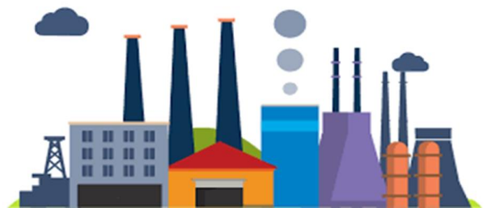
Fig -1: First priority focusing on industries

The first priority involves the primary avoidance of pollution and waste by expecting ventures to eliminate or reduce the amount of harmful chemicals used in production, reduce packing materials for products and make products that last longer and are easier to recycle, reuse and repair. This first priority targets large industry and endeavours to reduce the overall waste produced at the source.