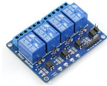
Fig -2: Relay Unit

A Relay is a special type of switch, which contains an Electromagnet. When a current flow through the coil an Electromagnetic field is set up [6]. The contacts at the ends of iron armature are pushed together for completing the circuit. Thus relay acts as a switch which is operated electrically. In the open state, when the relay is activated and circuit is closed. In the closed state, when the relay is inactive, circuit gets disconnected, allowing no current to flow. Thus relay provides a safety logic.