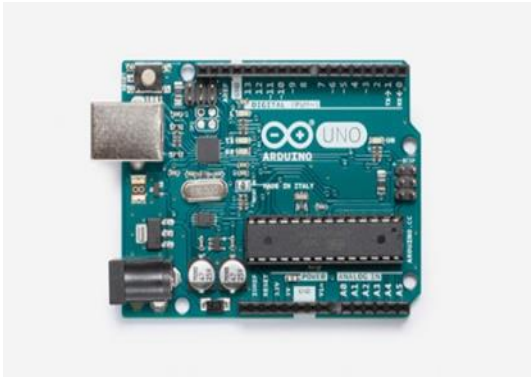
Fig -1: Arduino Microcontroller