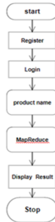
Fig 2 Data Flow

In this part the data flow the of application is explained to make clear the concept.