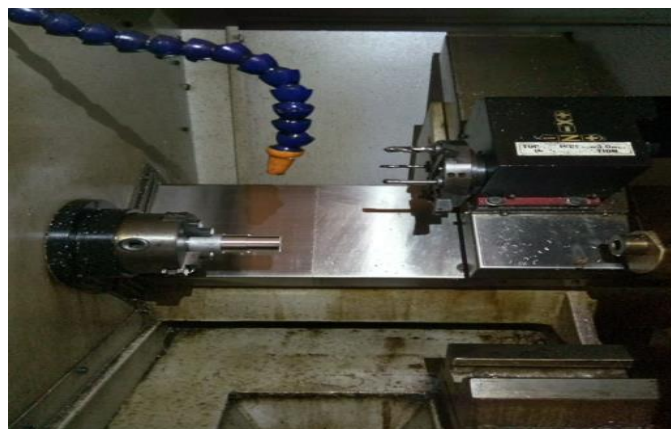
Fig -1: CNC Lathe Setup for turning process