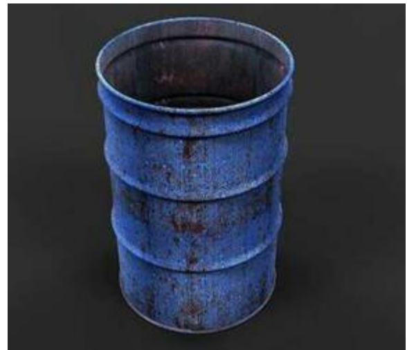
Fig. 1.1.1. Oil collecting drum

advantages of low working and low support costs and the offer of recyclable cutting oil, as a rule exceed the slight included cost of the underlying plans.