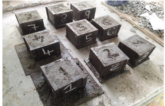
Fig. 1: Casting of Cube specimen

Cube moulds were cleaned, oiled and bolted properly before pouring of mortar. Mortar prepare in cleaned plastic tub by properly hand mixing. For hand mixing for preparing mortar, first off all the cement, sand and/or stone dusts are properly mixed in dry condition and then required quantity of water is added and again mixing up to the thoroughly same colour mixed.