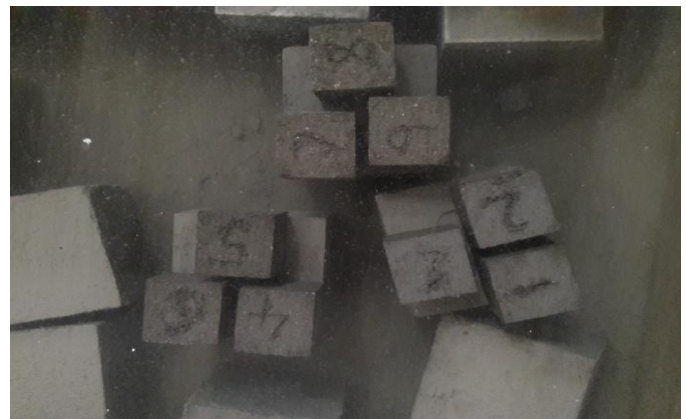
Fig. 2: Curing of Cube specimen

After properly mixing of the mortar, Mortar was placed in to moulds in sequentially in three layer and each layer are well compacted. After that cubes were demoulded after 24 hours and cured in the curing tank. Cubes were cured at 3 days, 7 days and 28 days in curing tank. These cubes were tested on the universal testing machine for their compressive strength as per IS 2250-1981.