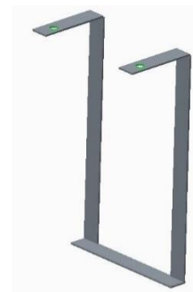
Fig 1: frame using proe

The setup is designed and modeled using PRO-E package. PRO-E model of the frame is shown in fig. 1. Mild steel rectangular solid is used to fabricate the frame.