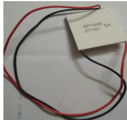
Fig 6: thermoelectric generator module