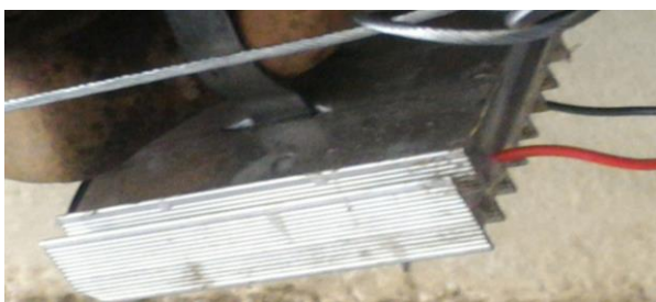
Fig 5: thermoelectric generator setup

It is used to provide power during battery drain down. It's produced power by seek back effort, it is fixed at the silencer then one side of thermoelectric generator and another side of thermoelectric generator with fin.