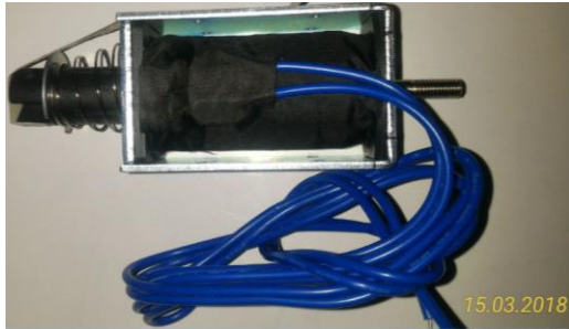
Fig 3: electromagnetic actuating coil