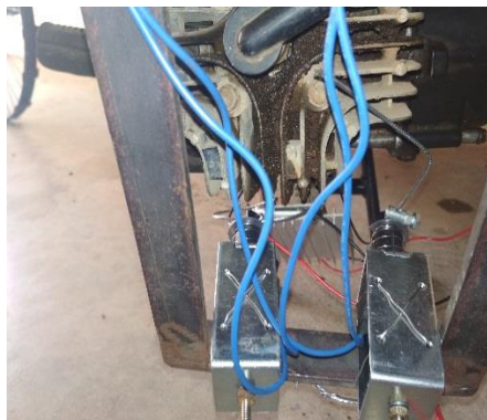
Fig 7: front view

leave the hand brake then that first magnetic actuating get de-energies to come back to original position. When press the hand brake pull and hold in a full brake distance then second magnetic actuating is get activated to pull the second brake wire connection to hold the brake drum at the full holed position. When leave the hand brake then second, first magnetic actuating coil is get de-energies to leave the brake in a normal resting position. This two magnetic actuating coil is used to make the electromagnetic actuating brake as the normal brake. Disadvantage like the electromagnetic actuating brake is used as the emergency brake is get rectified by using two actuating coil is connected to the different brake wire length.