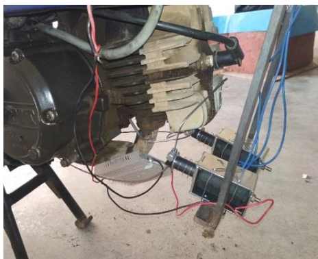
Fig 8: left side view