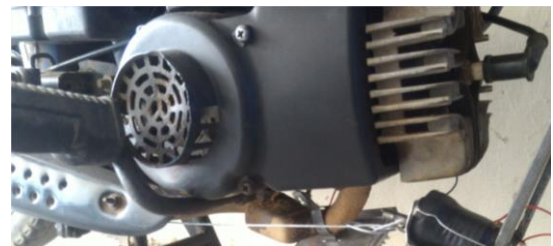
Fig 2: IC engine with bick setup

IC engine is used to rotate the wheel in the experimental setup. the rotation of the wheel on a vehicle. 1250 rpm IC engine was used for the purpose.