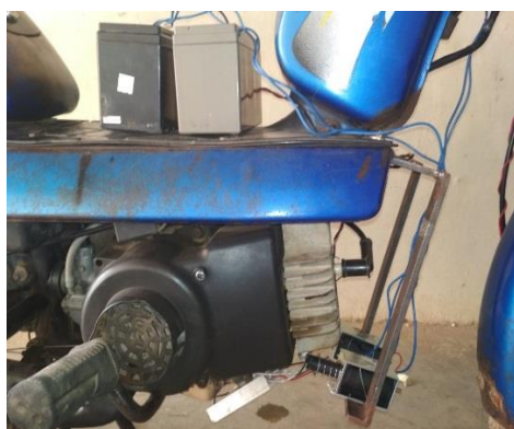
Fig 9: right side view